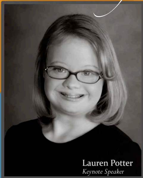
Lauren Potter Keynote Speaker

Featuring keynote speaker Lauren Potter from the 2010 Golden Globe award winning show Glee